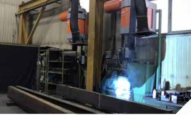
Welding TIG/MIG-MAG up to 3000 x 3000 x 5000 mm, up to 5 t