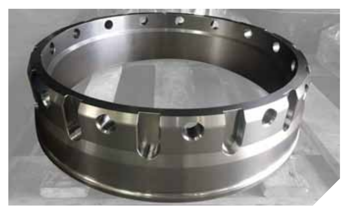
CNC Turning max workpiece length 4 000 mm, D<sub>max</sub> 1090 mm